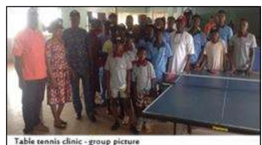
Table tennis clinic - group picture

In order to expose the identified budding talents to external competitions to gain