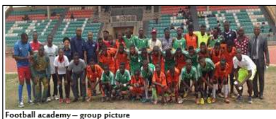
Football academy - group picture

experience, we sponsored some tennis players to participate in two external competitions viz an athlete to the CBN Open Tennis competition held in Abuja and 2 players at the National Youth Games held in Ilorin.