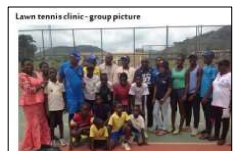
Lawn tennis clinic - group picture