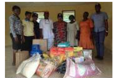
Donation of goods and food items to a children home

In particular, we were able to undertake one community project (road filling and leveling for a community in Ado-Ekiti to curb erosion). During the year, we also visited Erelu Adebayo Children home twice to provide goods and food items. And lastly, we recorded our first pre-natal support beneficiary, albeit in faraway Ibadan.