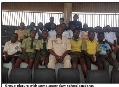
Group picture with some secondary school students

Operations are now in full swing, touching all the educational levels post primary school. Scholarships were awarded to 59 indigent secondary school students against a target of 50. The