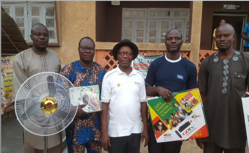
Group photograph with winners of the indigenous Ayo Competition with their prizes.