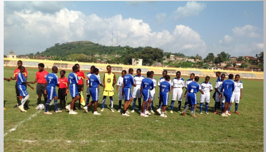
Teams from 2 schools getting ready to kick-off