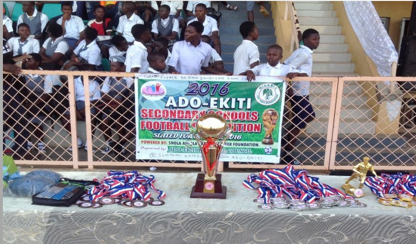
Medals and Trophy of the first Ado-Ekiti Secondary Schools football competition.