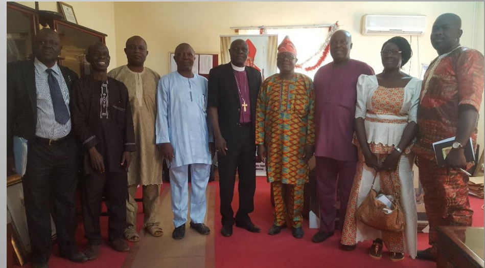
Working Committee members of the Pre-Natal Support Programme in a group photograph with the Ekiti Anglican Diocese Bishop.